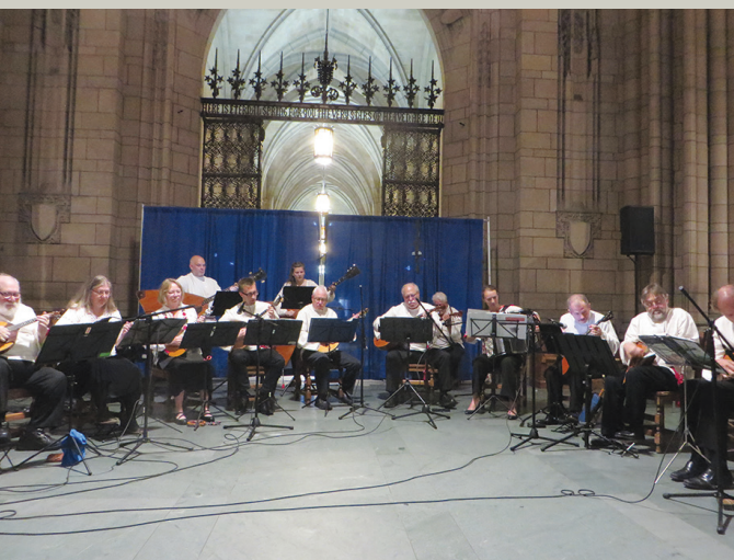
Russian Balalaika Orchestra