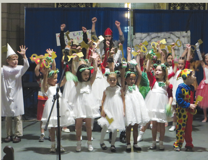
Constellation of Talent Children's Choir