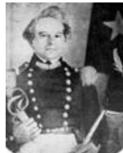
Đorđe Šagić, kasnije poznat kao Đorđe Fišer, stigao je u filadelfijsku luku 1815. godine Đorđe Šagić, who was later known as George Fisher, arrived via the port of Philadelphia in 1815