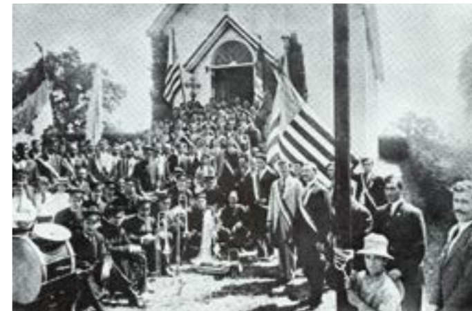
Osvećivanje prve srpske pravoslavne crkve Sveti Sava, Džekson, Kalifornija, 1894.

Many immigrants lacked any specific job skills and didn't speak English. As such, they were only able to find work in mines and the steel industry, or travelling throughout the country building railroads. Only a small minority of them could afford to own businesses, such as grocery stores, restaurants and saloons. Work in the mines and the steel industry was very arduous and insecure, as they laboured under very difficult working conditions and had shifts lasting 12 hours per day. Mining accidents were very common and resulted in many workers losing their lives. The American Srbobran publication reported these accidents in the mines and steel industry. In one of many articles, it was reported that 1,500 miners