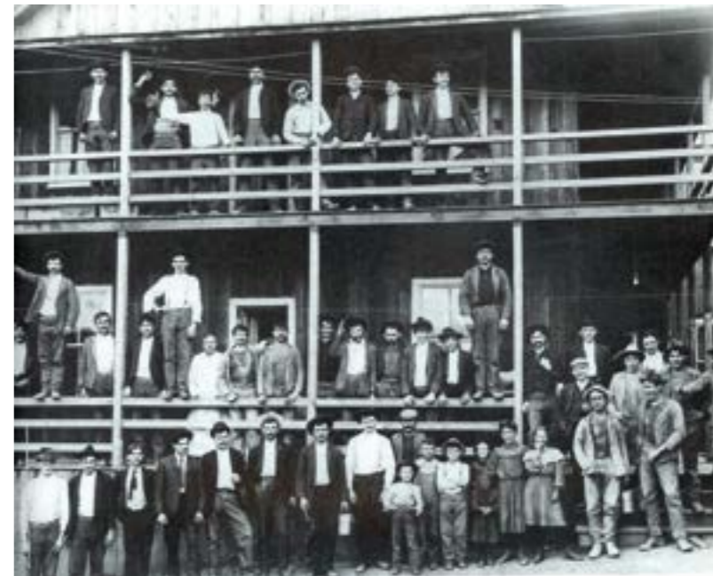
Angels Camp, 1900, srpski imigranti u pansionima u Kaliforniji Angels Camp, 1900, Serbian immigrants in boarding houses in California

na od nesreće dogodila se na Svetog Nikolu, kada je 400 rudara izgubilo život. Među nastradalima nije bilo Srba jer su ostali kod kuće da slave Svetog Nikolu.