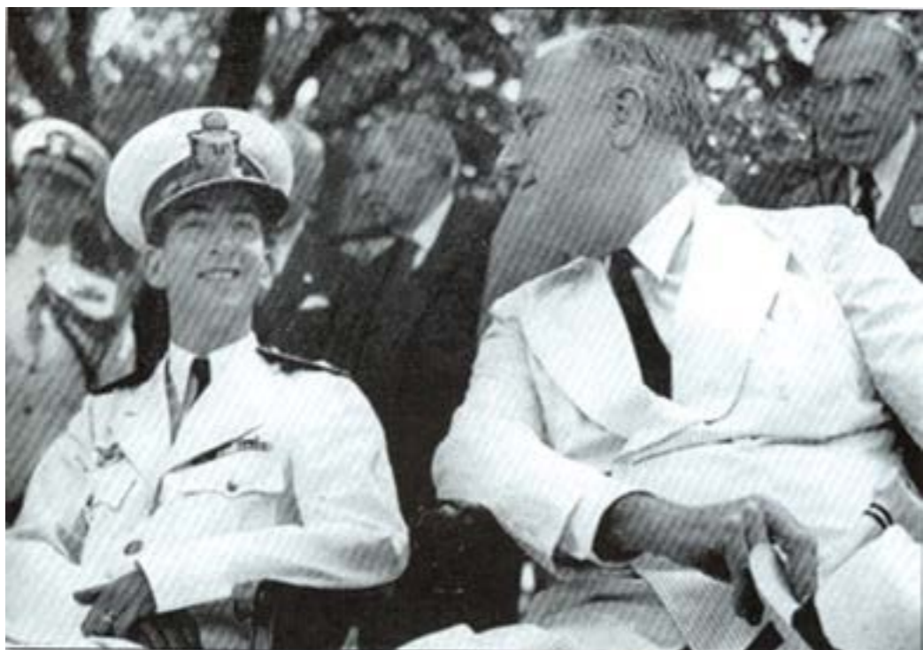
Kralj Petar sa predsednikom Ruzveltom King Peter of Yugoslavia with President Roosevelt

Pošto su iseljenici uglavnom bili neoženjeni, živeli su zajedno sa svojim sunarodnicima u pansionima sa jeftinim obrocima i rentom. Kako je broj iseljenika rastao, tako su nastojali da se organizuju u razne organizacije, kulturna društva, bratstva i cr-