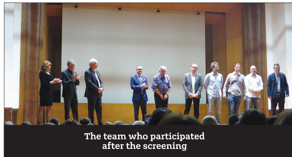
The team who participated after the screening