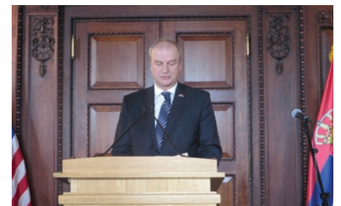
H.E. Djerdj Matkovic, Ambassador of the Republic of Serbia to the United States