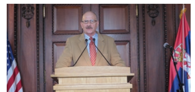
Ted Poe, United States Representative (2nd District Texas)