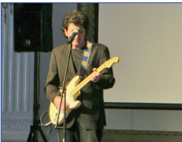
Bajaga of Belgrade in performance