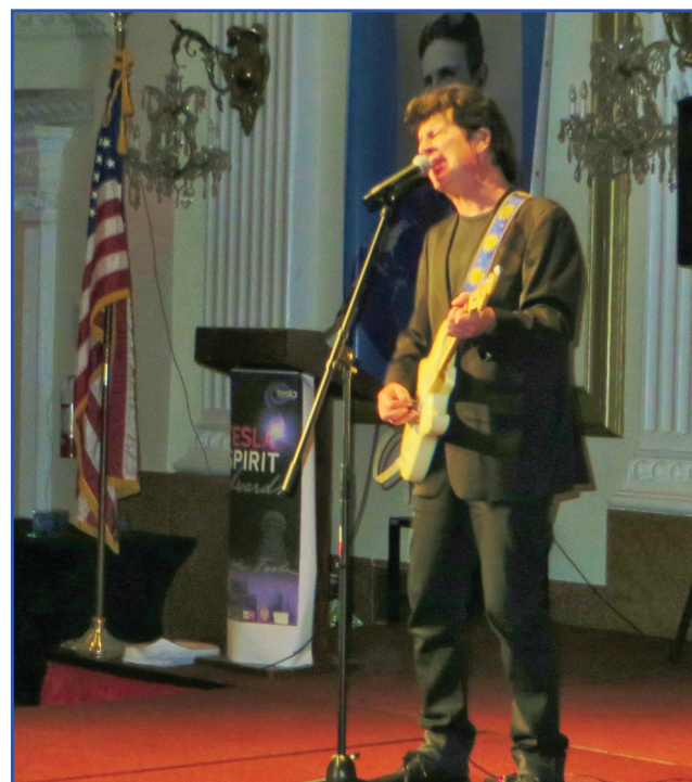
Bajaga, Serbian popular musician in performance