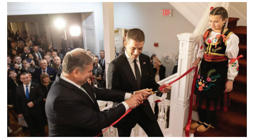
H.E. Marko Djuric and Gabriel Escobar officially opened the new building of the Embassy of the Republic of Serbia

The Serb National Federation congratulates the Embassy of the Republic of Serbia for opening a new building and further developing its relationship with the United States. We hope a new historic building will be a beacon of the relations between the two countries and help preserve Serbian culture and tradition in the United States.