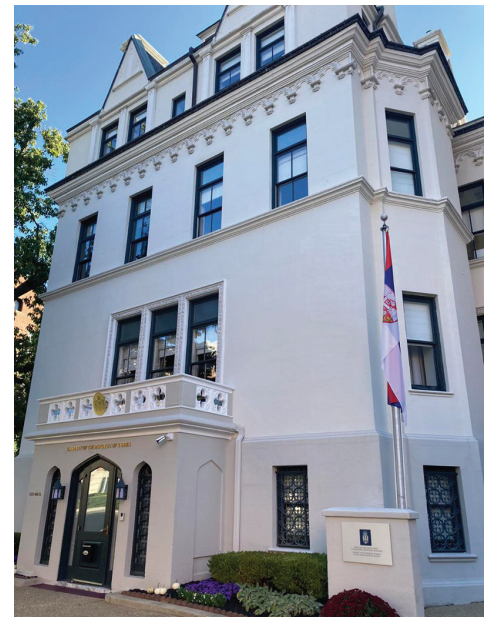
A view of the new building