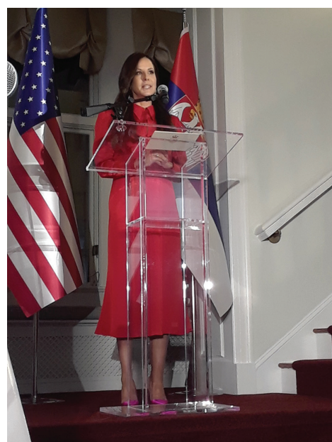
Tamara Vucic, First Lady of Serbia