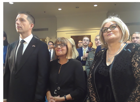
From left are H.E. Marko Djuric, Maja Gojkovic, and Jorgovanka Tabakovic