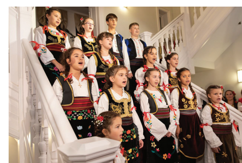
Serbian Folklore Group “Opancici”