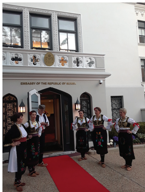
Serbian Folklore Group “Opancici” welcomed guests in front of the new Serbian Embassy building