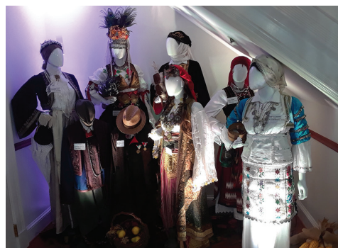
The exhibition of Serbian traditional costumes

The Embassy of the Republic of Serbia sponsored the opening reception for officials, diplomatic staff, businessmen, Representatives of the Government of the Republic of Serbia, and the Serbian-American communities. Representatives of the Government of Serbia who were present included Vladimir Orlic, President of the Serbian Parliament; Maja Gojkovic, Vice-President and Minister