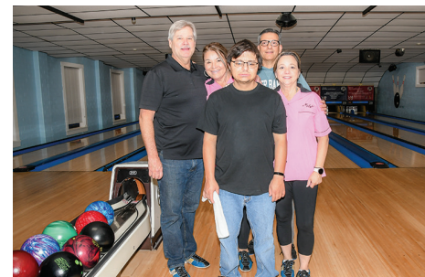
Team Lightning Strikes