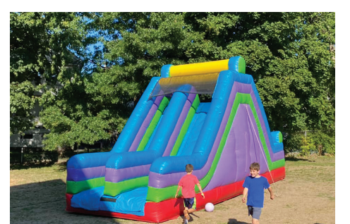
Fun for the younger crowd

Photographs by Milos Rastovic & St. Sava Serbian Orthodox Church, Boston, MA