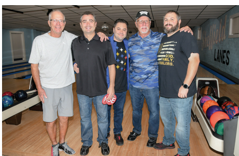
Team Pin Pals