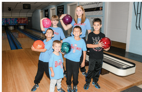
Team Junior Bowlers #1