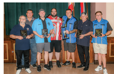
Men's Runner up— Team Sveti Ilija