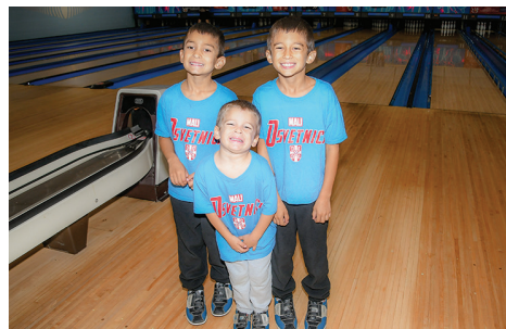
Team Junior Bowlers #2