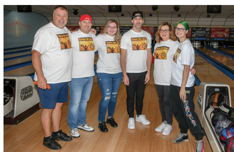
Team Serbian Turkeys