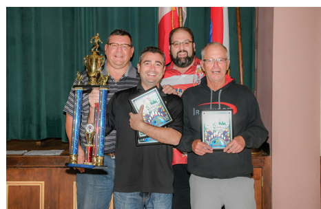
Men's Team Champions— Team Pin Pals