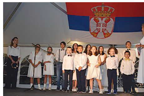
Children's Choir of Maine