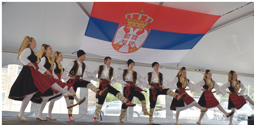
Serbian Folklore Ensemble Gracanica from Boston