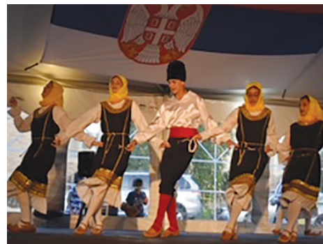
St. Stephen's Tamburitza and dancers of Lackawanna, New York