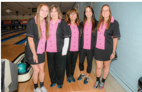
Team Grubich Girls