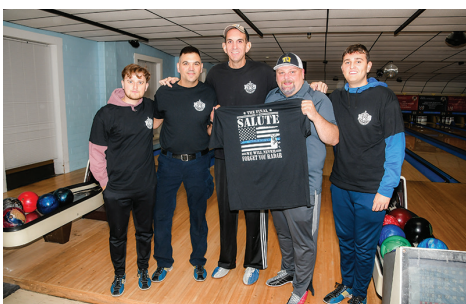
Team Radar Serbs